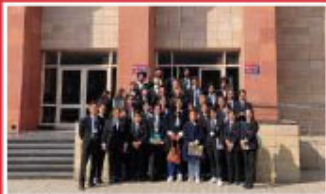
CBI/NIA COURT VISIT