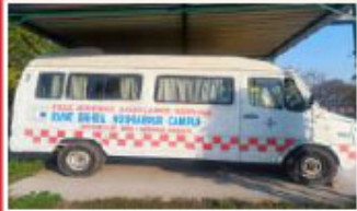
MEDICAL CARE CENTRE