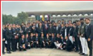
PUNJAB & HARYANA HIGH COURT