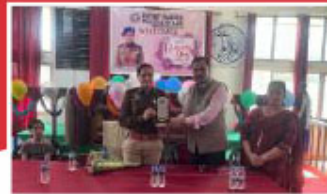
WOMEN DAY CELEBRATION